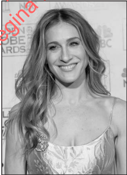
Sarah Jessica Parker