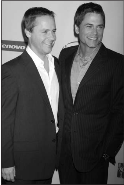
Chad & Rob Lowe